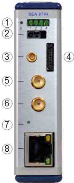
Fig. 1: Front side