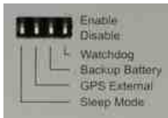
Fig. 5: DIP Switches

The DIP switches are placed on the imprinted side of the module. They are considered to customize the module's features according to users needs.