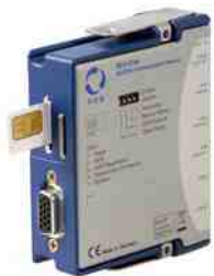
Fig. 3: Insert SIM

In order to use the available services ensure that the SIM card is enabled for packet data usage by the MNO.